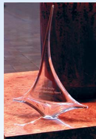
Annual Leadership Award